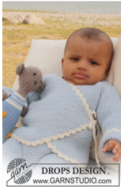
DROPS Baby 20-24

Materials: DROPS MERINO EXTRA FINE from Garnstudio 50 g colour no 07, light brown mix 50 g colour no 19, light grey/blue